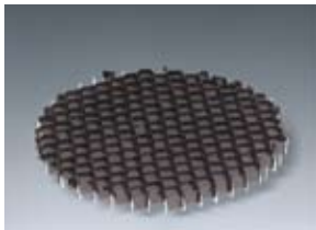
CL25 Louver, 2-3/16" Dia.

Capri Lighting reserves the right to make changes without notice.©2008