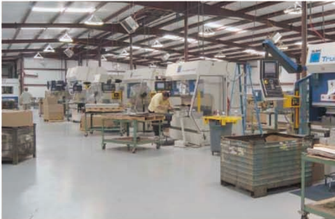
General work area within the Hawkeye, Industries, Inc. Plant

“Day-Brite Lighting is committed to a full service approach which can include customized lighting layouts. These layouts range from industrial applications to highly specialized retail environments. This service enables our customers to order an accurate number of luminaires while also giving them the most optimum use of our lighting systems.”