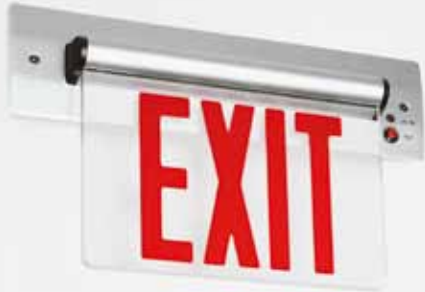
rotating exit panel